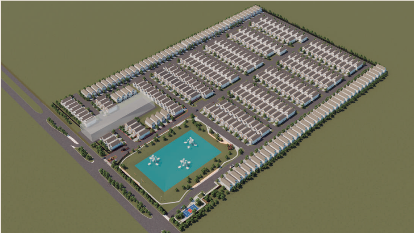
334 HOMES IN TWO PHASES